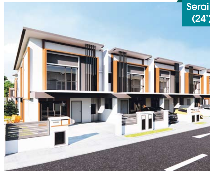
Serai 2 (24')