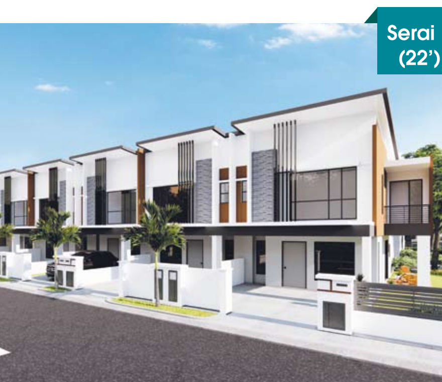
Serai 1 (22')